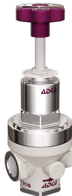
PS31SS 1/2" – DN 15

ORDER REQUIREMENTS: Type of fluid. Maximum operating temperature. Required opening pressure capacity (maximum and minimum).